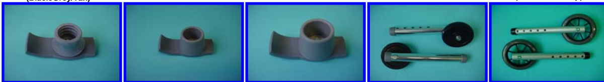
10220 (22.2mm) Skis