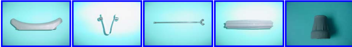
10021#1 Crutch Shoulder support