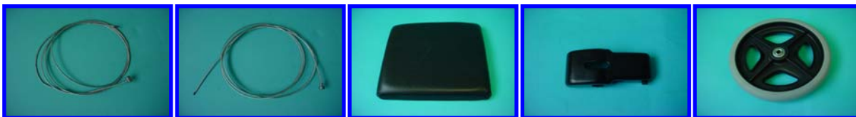
10283-31 Loop Brake Cable