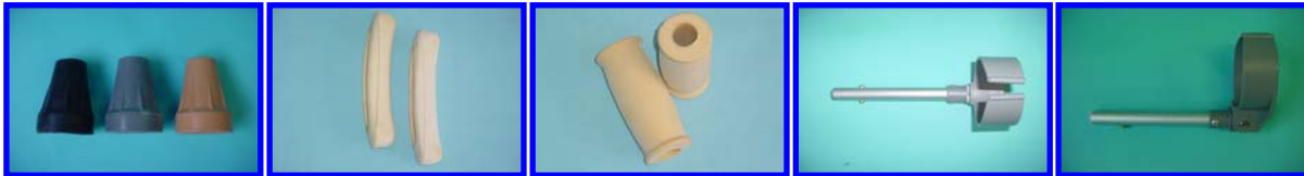
10032BLK/10032GR/10032T Heavy Duty Crutch Tip 22mm (Black/Grey/Tan)