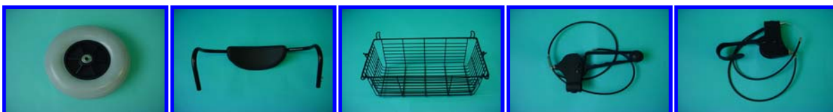
10281-51 Steel Rollator Solid Tyre