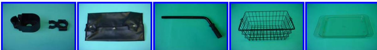
1CC Rollator Cane Holder